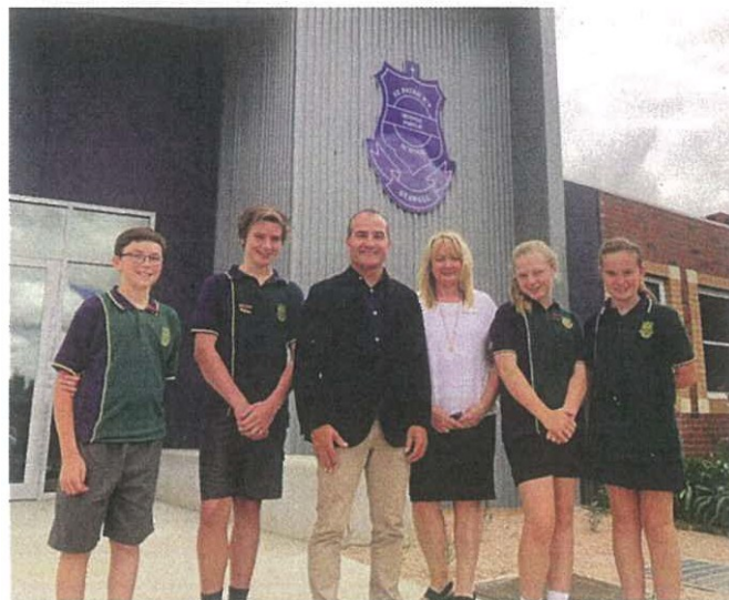
School Leaders from St Patrick's School, Stawell, meeting Deputy Premier James Merlino during his visit to the school.