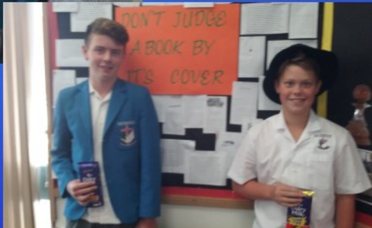
Jack and Jake

Students were kept guessing when several books were wrapped in brown paper with only a copy of the novel's first page, to guide them on the novel's identity. To win you needed to identify the title of as many books as possible.