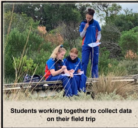
Students working together to collect data on their field trip