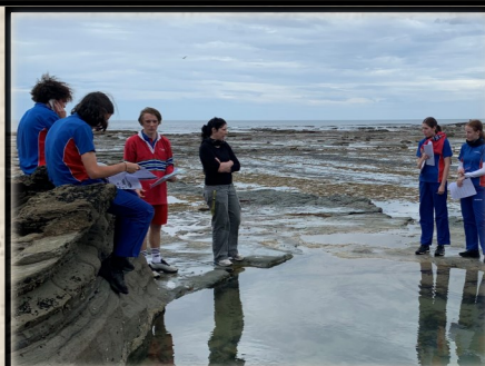
Exploring the rock pools - identifying and classifying organisms