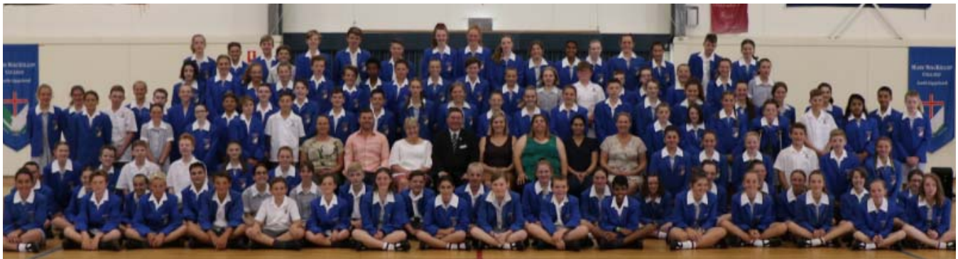
2019 - Year 7's First Day of School

The Orientation program includes all students enrolled in Year 7 in the following year to experience a complete school day. It is a further opportunity for students to mix socially and for teachers to develop a relationship with students to assist in the development of class lists. Second-hand school uniform is able to be purchased and any last minute questions can be addressed in order to prepare for the academic year ahead.